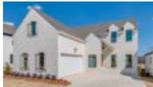
7135 Fain Park Drive