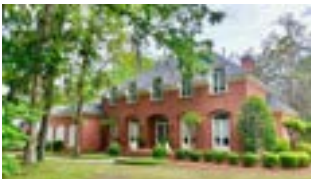
8112 Wyndridge Drive