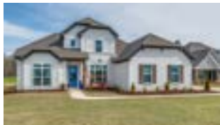
8207 Young Crossing