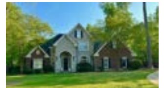
8106 Nunn Trace