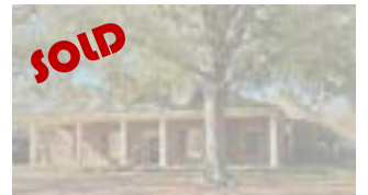
8142 Wynlakes Blvd