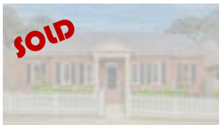
8160 Oak Alley