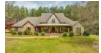
1405 Antioch Road