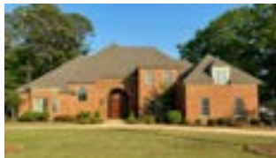
7565 Lakeridge Drive