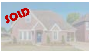
9471 Winfield Place