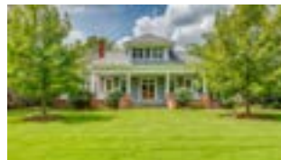
1604 Gilmer Ave