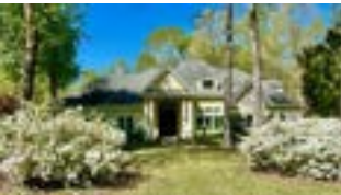
8370 Timber Trace