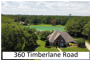
360 Timberlane Road