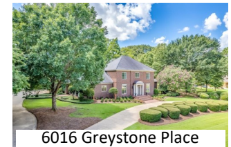
6016 Greystone Place