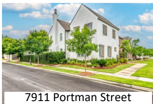
7911 Portman Street