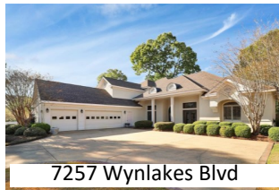
7257 Wynlakes Blvd