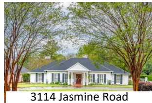
3114 Jasmine Road