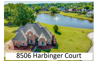
8506 Harbinger Court