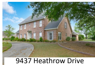
9437 Heathrow Drive