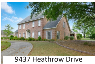
9437 Heathrow Drive