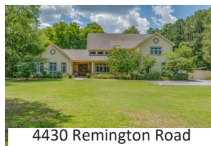
4430 Remington Road