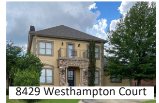
8429 Westhampton Court