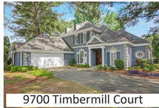
9700 Timbermill Court