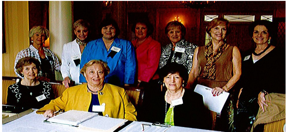
Wynlakes Women's Club