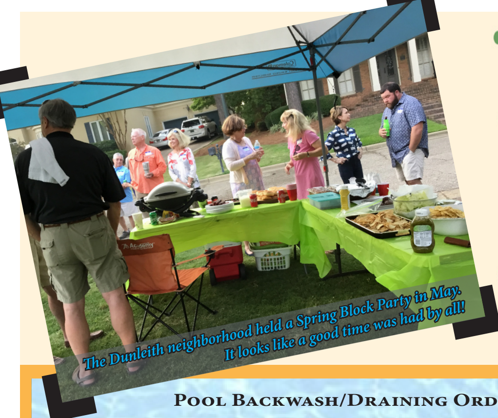
The Dunleith neighborhood held a Spring Block Party in May. It looks like a good time was had by all!