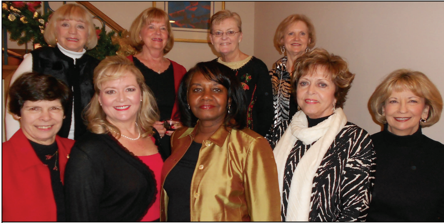
Members who keep the club informed about all business for each month