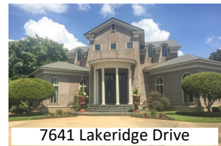
7641 Lakeridge Drive