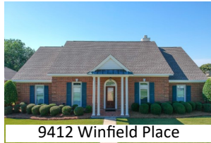
9412 Winfield Place