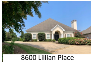
8600 Lillian Place