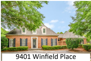
9401 Winfield Place