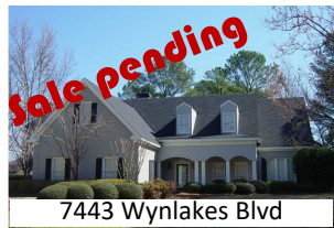
7443 Wynlakes Blvd