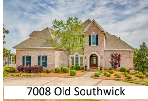
7008 Old Southwick