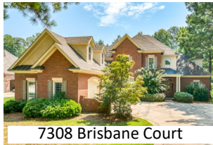
7308 Brisbane Court